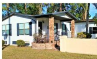
53N Pine Lakes Blvd., $20,000