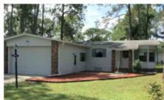
56H Sun Air Ct., $29,500