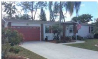
42H Meadows Ct., $44,900