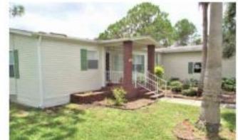
33H Hidden Hills Ct., $49,900