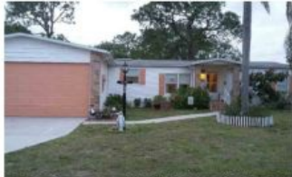
14K Diamond Hill Ct., $53,000