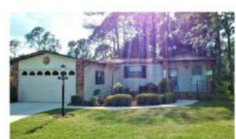
53H Summer Tree Ct., $37,500