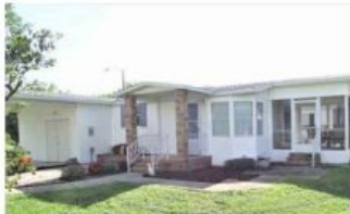
14M Circle Pine Rd., $35,000

List or purchase your home through the top-selling sales broker for homes on leased land in Pine Lakes Country Club and Lake Fairways. Take a look at these recent listings: