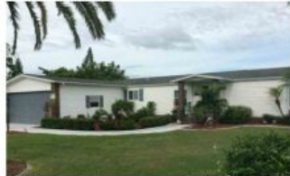
32G Grand Cypress Ct., $94,600