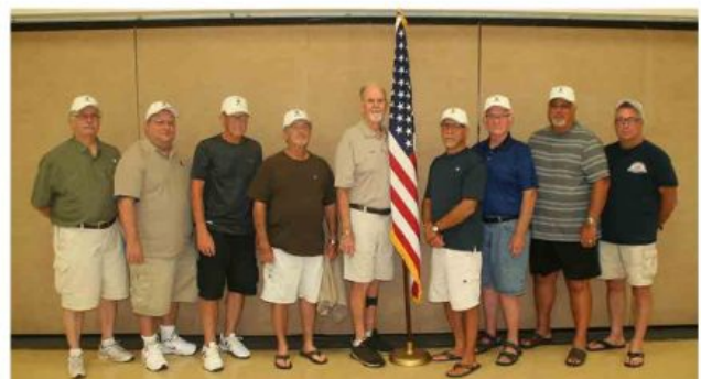
New Members...No names at this time.