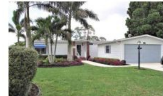
63G Tarpon Woods Ct., $39,900