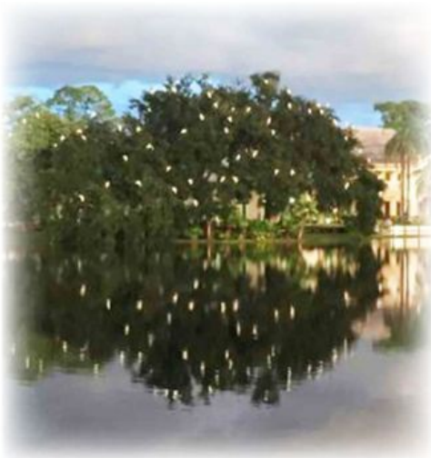
Snowbirds???

Welcome back, Snowbirds. We have missed you.