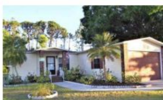
62E Tarpon Woods Ct., $35,000