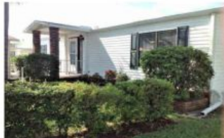
16F Diamond Hill Ct., $54,000