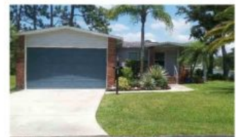
49Q Saddlebrook Ct., $48,000