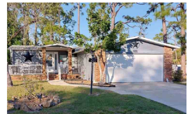
62i Tarpon Woods Ct., $98,800