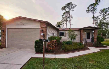
12K Cypress Woods Ct., $90,000