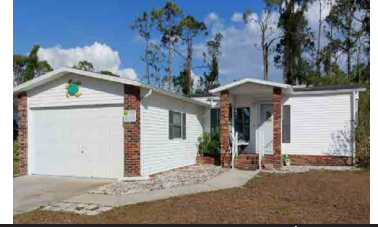
62F Tarpon Woods Ct., $75,000