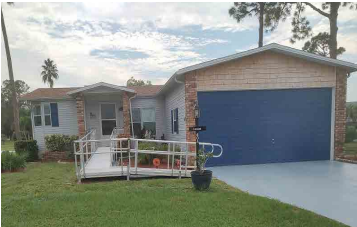
40A Moss Creek Ct. $84,900