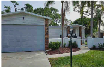
37i Ravines Ct., $120,000