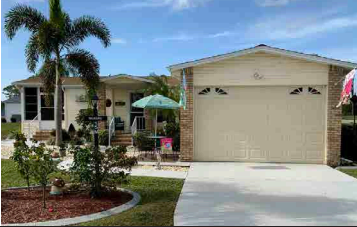
15M Circle Pine Rd., $131,900

List or purchase your home through the top-selling sales broker for homes on leased land in Pine Lakes Country Club and Lake Fairways. Take a look at these recent listings: