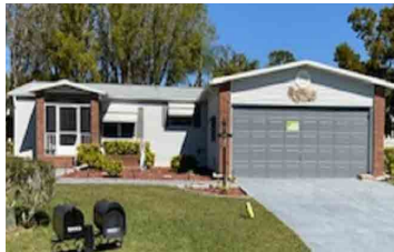
44E Mangrove Bay Ct., $140,000