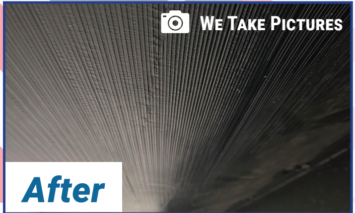
📷 WE TAKE PICTURES