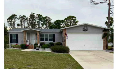
32D Grand Cypress Ct., $139,000