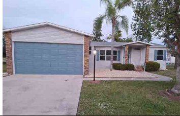
30H Gator Creek Ct., $163,000