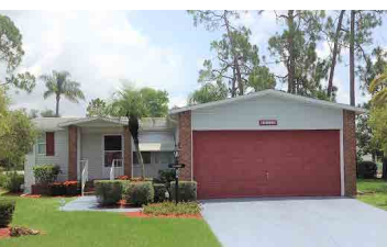
31B Gator Creek Ct., $49,900