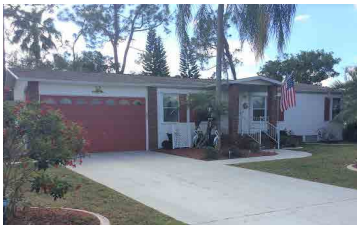
42H Meadows Ct., $39,900