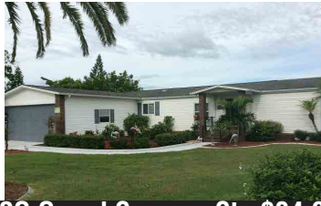
32G Grand Cypress Ct., $94,600