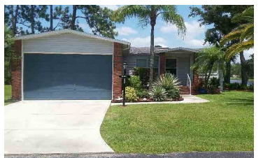
49Q Saddlebrook Ct., $44,000