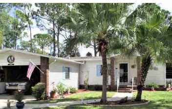
59M Sun Air Ct., $38,000