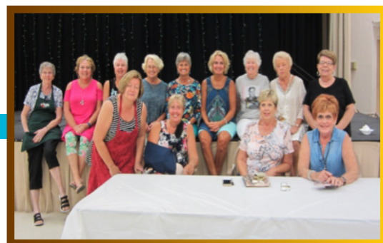
Having Too Much Fun With Delicious Ice Cream!