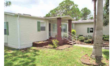
33H Hidden Hills Ct., $49,900