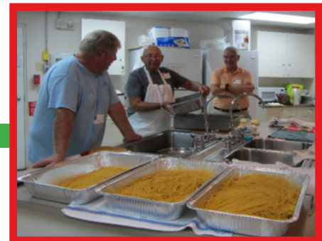
WONDERFUL PASTA CREW— ASK THEM HOW TO TEST COOKED PASTA