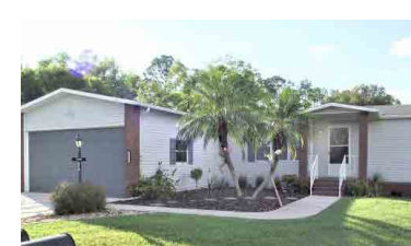
45B Lone Palm Ct., $42,900