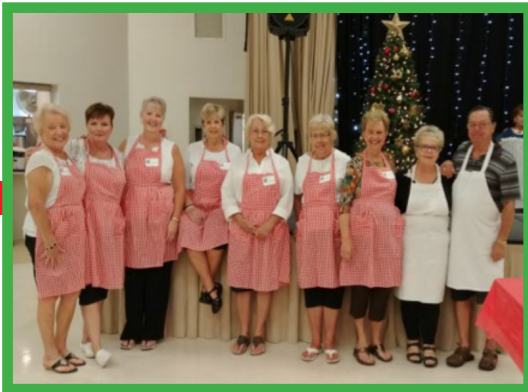
SERVERS AND "RUNNERS"