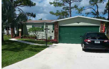
12E Cypress Wood Ct., $35,500