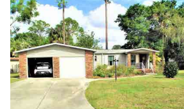
62J Tarpon Woods Ct., $30,000