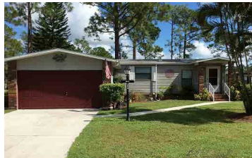
56B Sun Air Ct., $45,000