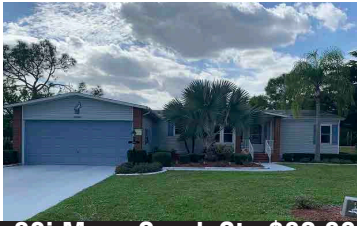
39i Moss Creek Ct., $82,000