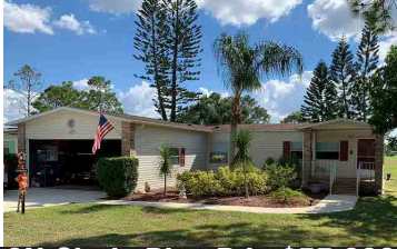
9N Circle Pine Rd., $55,000

List or purchase your home through the top-selling sales broker for homes on leased land in Pine Lakes Country Club and Lake Fairways. Take a look at these recent listings: