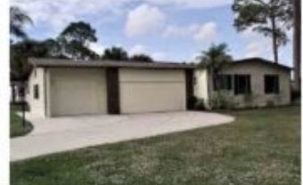
48L Rolling Hills Ct., $59,900