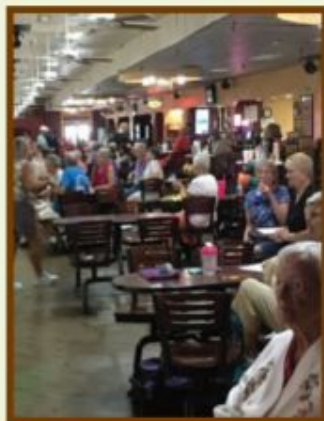
Bowlers waiting to attack the alleys!