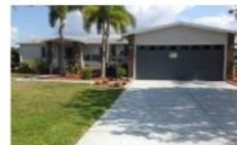
32F Grand Cypress Ct., $55,000