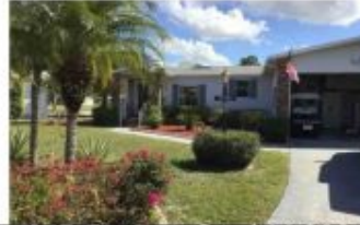
34D Ravines Ct., $44,900