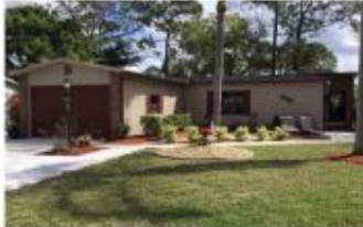
14G Diamond Hill Ct., $53,900

List or purchase your home through the top-selling sales broker for homes on leased land in Pine Lakes Country Club and Lake Fairways. Take a look at these recent listings: