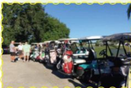
Golden Oldies lined up ready to play golf!