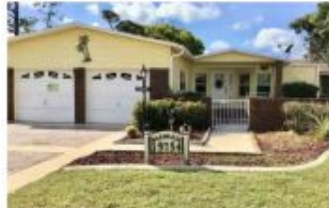
13E Cypress Wood Ct., $48,000