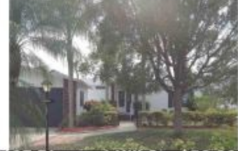
16F Diamond Hill Ct., $56,900