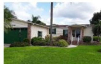
44A Mangrove Bay Ct., $64,900