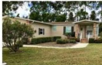
46J Lone Palm Ct., $39,900