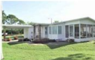
14M Circle Pine Rd., $26,000