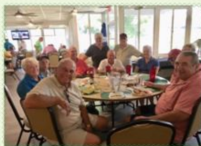
Golden Oldies summer pizza party!