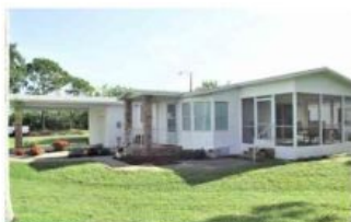
14M Circle Pine Rd., $26,000