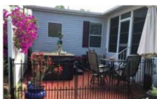
13F Cypress Wood Ct., $58,500