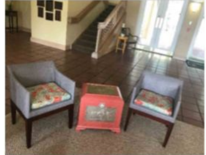
Clubhouse Living Room Refreshed by Beautification Team & ELS