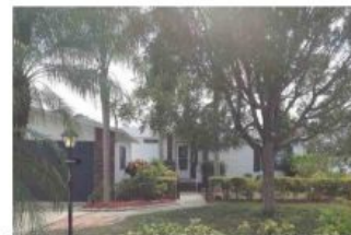
16F Diamond Hill Ct., $56,900