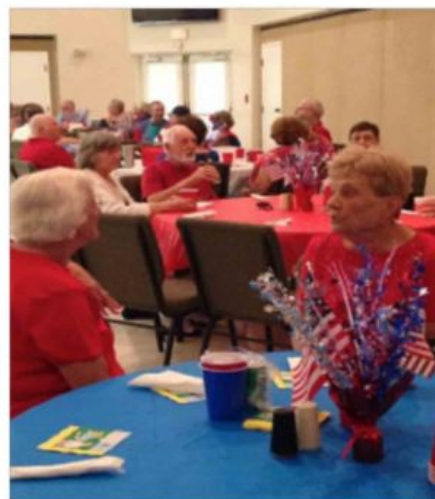
July 4, 2019 CELEBRATION (sponsored by Beautification Team)