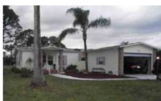
37B Ravines Ct., $59,900