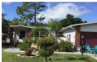
13F Cypress Wood Ct., $58,500