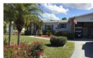
34D Ravines Ct., $44,900