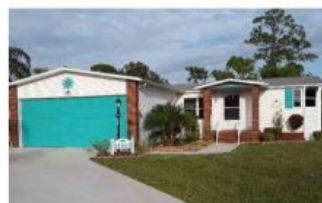
42A Meadows Ct., $45,000