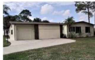
48L Rolling Hills Ct., $65,900