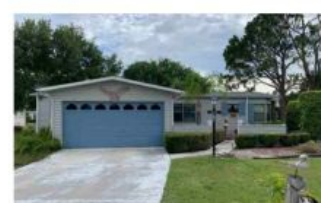
60K Sun Air Ct., $25,800