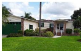
44A Mangrove Bay Ct., $64,900