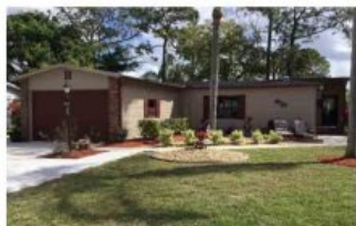
14G Diamond Hill Ct., $53,900

List or purchase your home through the top-selling sales broker for homes on leased land in Pine Lakes Country Club and Lake Fairways. Take a look at these recent listings: